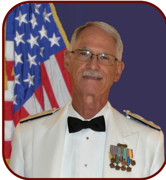
District 7 Commodore