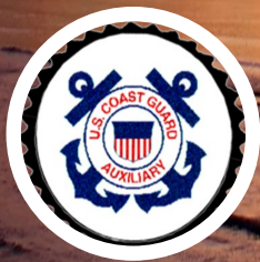
Lawrence Hooks Flotilla 10-10