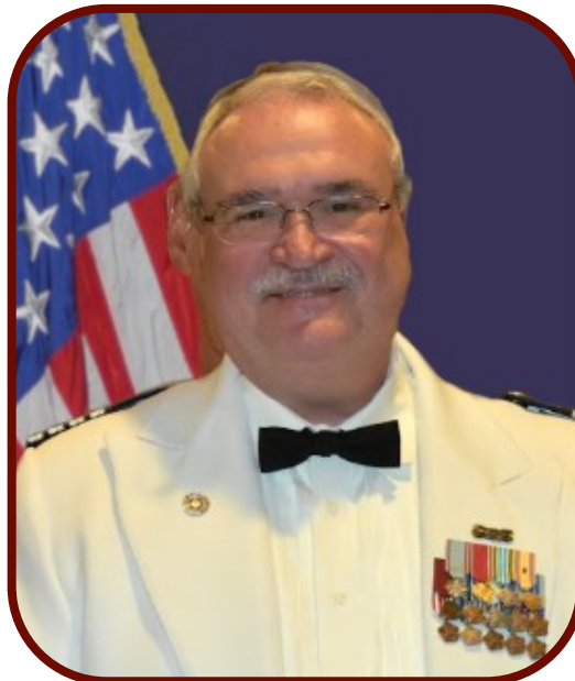
Chief of Staff